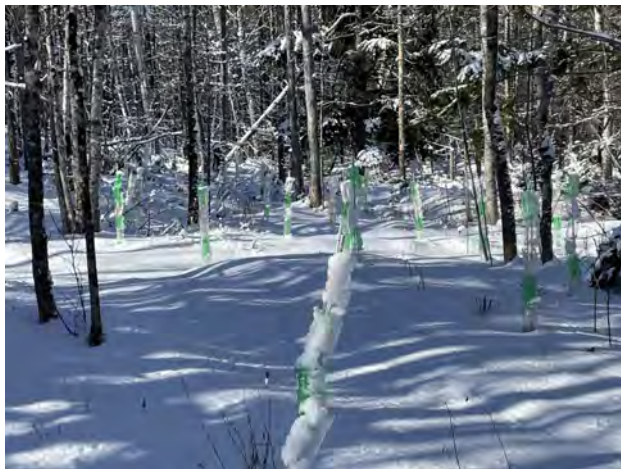
Homemade tree tubes protecting saplings

Shana is a font of knowledge not just about trees and plants, but also their relationships with grazers. For example, browsing by grazers can stimulate plant chemical responses that deter browsing. But at the