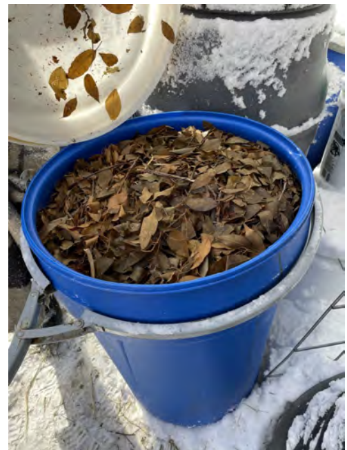
Ever stuck your nose in a barrel of cherry leaves? Try it some time—find out what all the goat-fuss is about!

Cattail & Sky Field is certified organic and Shana and her partners grow more than just blueberries. They’re promoting native American False Pennyroyal, and other tiny aromatics and flowering plants, in the bare areas between blueberry patches. The goal is to create havens for small species that