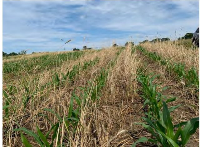
Silage corn established under No-Till Management in Troy

reasons why a farm would want to adopt residue and tillage management include: reduced fuel use and labor, reduced sheet and rill erosion, maintaining or increasing soil health and organic matter content, increase plant available moisture, and increased resiliency to the effects of excessive rainfall or drought. NRCS can provide technical and/or financial assistance to implement this