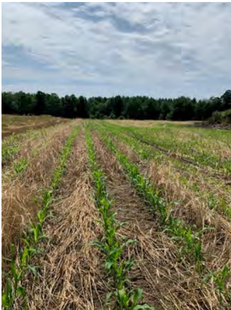
Silage corn seeded into winter rye residue

Residue and Tillage Management, No-Till, is a conservation practice used to limit soil disturbance while establishing a crop. Compared to full width tillage or conventional tillage, which disturbs the entire field, no-till disturbs a narrow slice or strip of the soil, leaving the majority of the field undisturbed. Why is this important? Each time the soil is tilled, there is negative impact to the structure of the soil. Poor soil structure leads to increased erosion, decreased infiltration and decreased nutrient cycling. An undisturbed soil has high aggregate stability which is more resilient to erosion, facilitates increased infiltration and